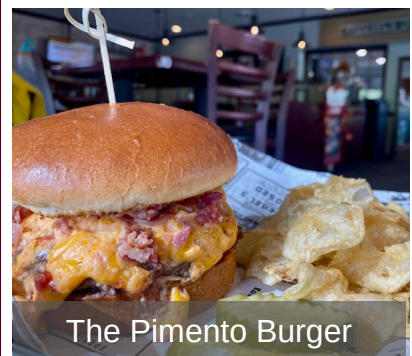
The Pimento Burger