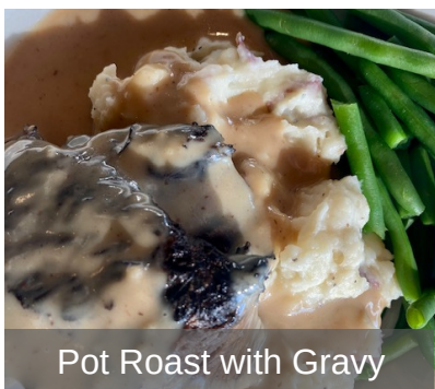
Pot Roast with Gravy

The entire Nickle Plate Team hopes to serve you throughout the holiday season!