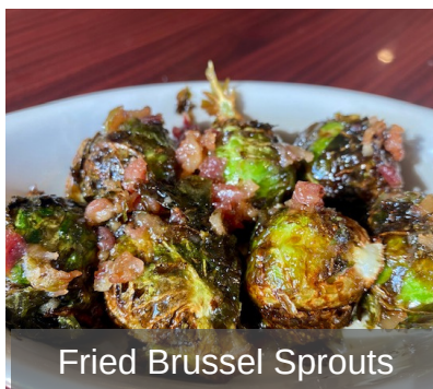
Fried Brussel Sprouts