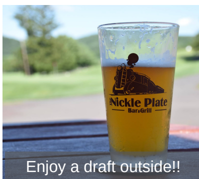
Enjoy a draft outside!!