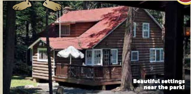
Beautiful settings near the park!