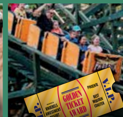
BEST WOODEN COASTER