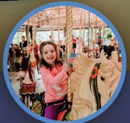
Voted Best Carousel

FREE Admission • FREE Parking • FREE Entertainment • FREE Picnic Facilities