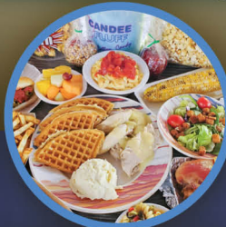
Voted Best Amusement Park Food