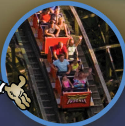
Voted Best Wooden Coaster