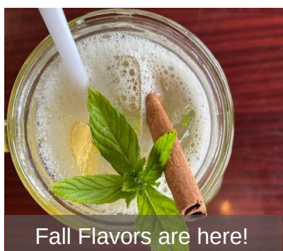
Fall Flavors are here!

LIKE and FOLLOW Nickle Plate Bar & Grill on social media for the most up-to-date hours, drink specials and menu items. WE ARE OPEN 7 DAYS A WEEK! Join us for dinner or drinks soon! We look forward to serving you both indoors and out!