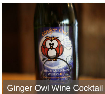
Ginger Owl Wine Cocktail