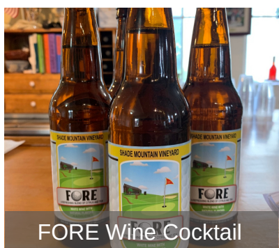
FORE Wine Cocktail

LIKE and FOLLOW Nickle Plate Bar & Grill on social media for the most up-to-date hours, drink specials and menu items. WE ARE OPEN 7 DAYS A WEEK! Join us for dinner or drinks soon! We look forward to serving you both indoors and out!