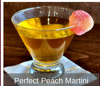
Perfect Peach Martini